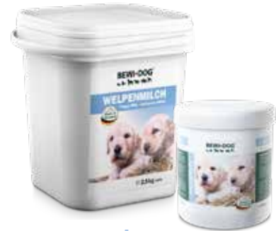
puppy milk 0.5 kg, 2.5 kg

For hand-raising puppies and as a supplement when the mother does not have enough milk